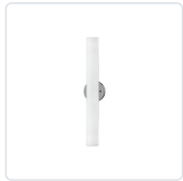
WS8324-BN Brushed Nickel